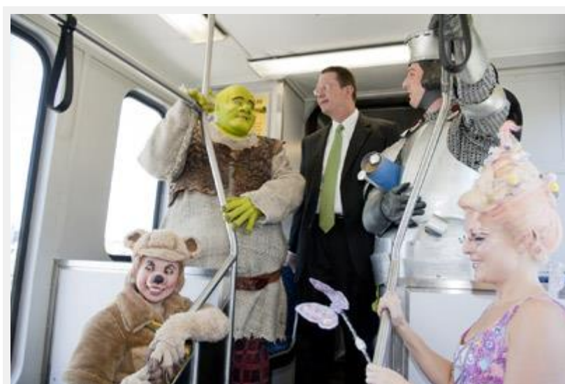
Cast members of Shrek the Musical join DART